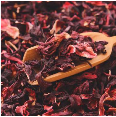
Dry Hibiscus Flower