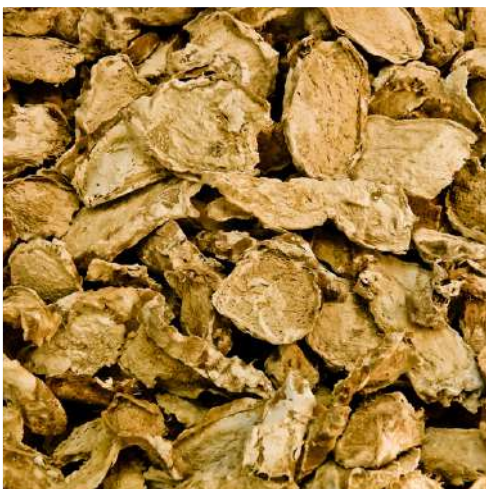
Dry Split Ginger